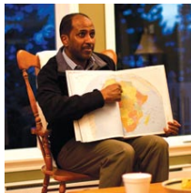
Above: Participants in Enterprise Saint John's Business Immigrant Mentorship Program gain the support of a professional and caring social network which helps them integrate into Saint John's business community.